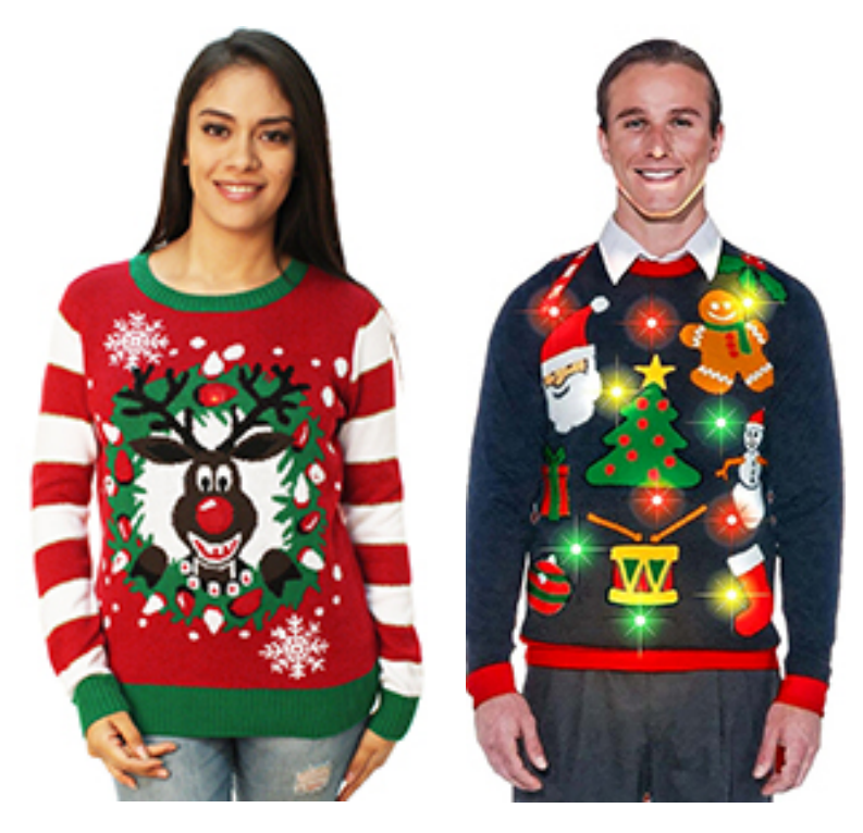
If you have a Christmas sweater (the louder the better!) why not wear it for the Crib service on Sunday December 24th!

So get yours out, it is the one day we are all encouraged to look like an idiot, or an elf, and join in the fun.!